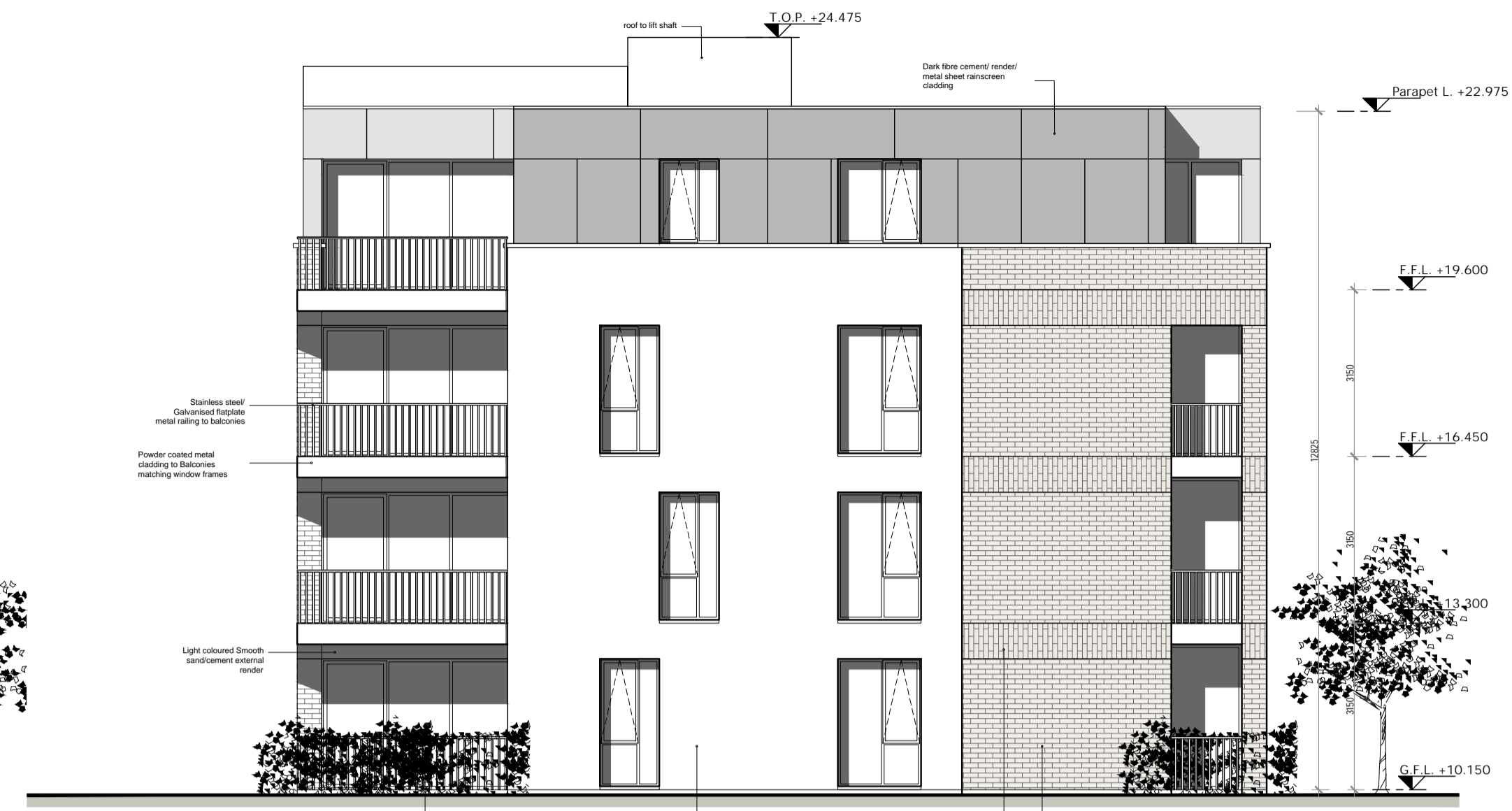
03 Western Elevation Scale 1:100